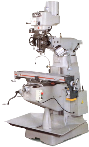
2S / 2VS