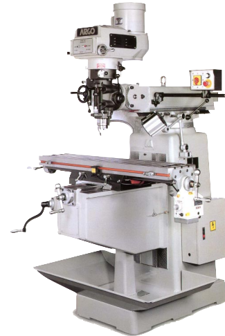
3VH / 3H