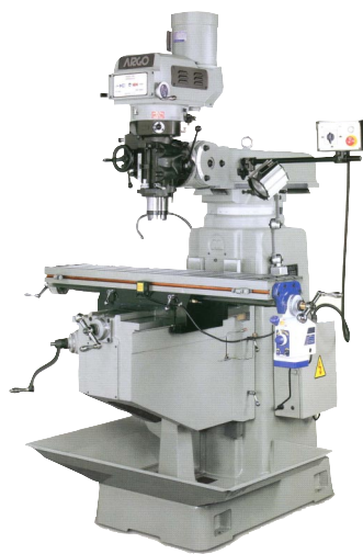
5VH / 5H