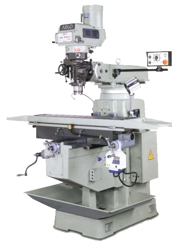
5VHL / 5HL